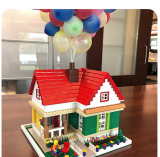
2020 Winner - Business