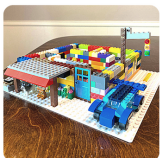
2020 Winner - Age 4-7