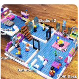
2020 Winner - Age 8-12