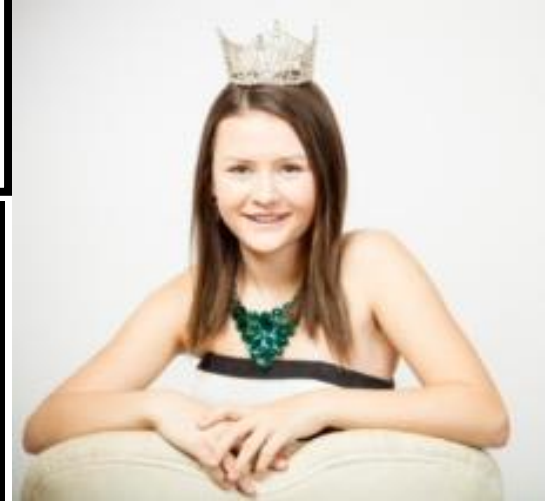
Miss Nebraska Junior Teen 2017

The Children's Museum creates a rich environment that allows a child's curiosity and creativity to happen naturally. I loved the museum as a child and still do today, which is why I enjoy going back as a volunteer to help with the many group activities they have going on. It's a time to be with family and do something everyone can enjoy. From the fire station and craft center to even the grocery store, it teaches kids life lessons like helping each other, it allows them to experience lots of different interests and career paths so they may figure out what their passions in life will be, all starting at a young age. For a child, play is a way to explore, learn, develop skills, and make friends. I believe the museum helps a child learn social skills necessary to succeed in their adult lives or simply make friends.